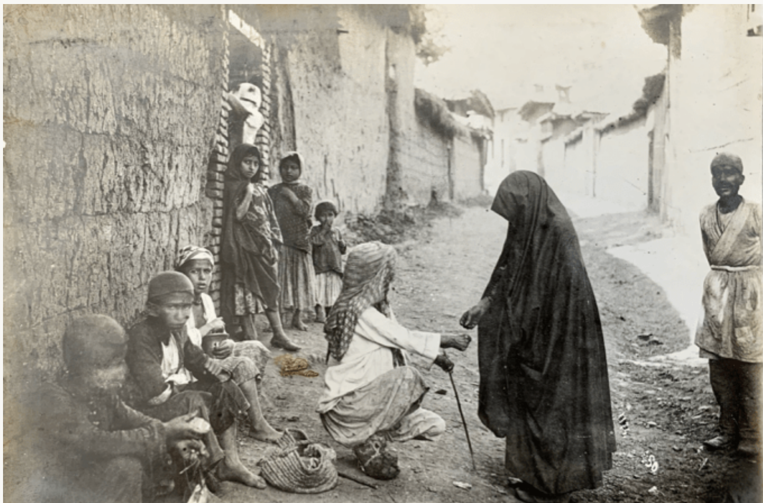
A street in Tehran in the late 19th or early 20th century PIN