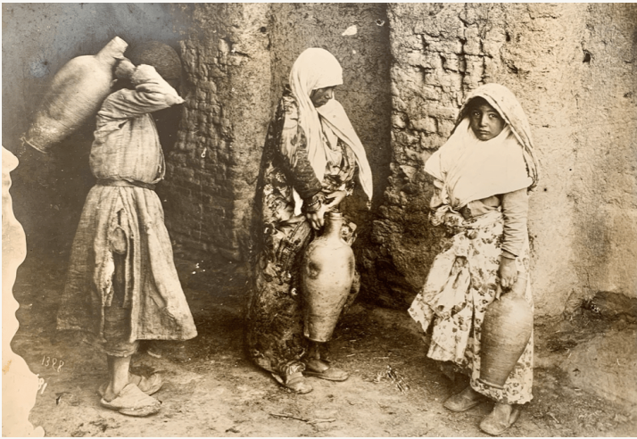
Women in Tehran collecting water from a sardab, an underground waterwell, around the turn of the century