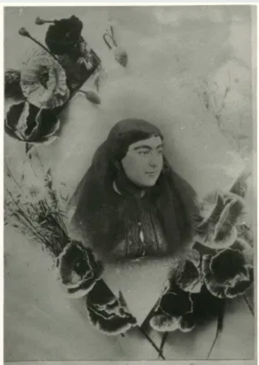
Zahra Khanum Taj al-Saltana, the daughter of Maryam Turan al-Saltana and Nasir al-Din Shah.

Despite having been written more than a hundred years ago looking specifically at the cholera epidemic in Iran, Taj al-Saltana's memoir has found new relevance in the age of COVID-19 and the failures of governance it has exposed worldwide.