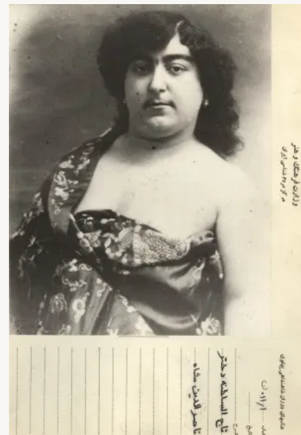
Taj al-Saltana

A century later, her words and resistance against the failures of patriarchal governments to stop pandemics ring truer than ever, and urges us to come up with better strategies of reform to challenge hegemonic socio-political structures.