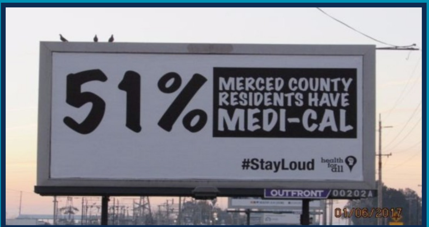
Photo: Billboard showing high rate of medi-cal in Merced County