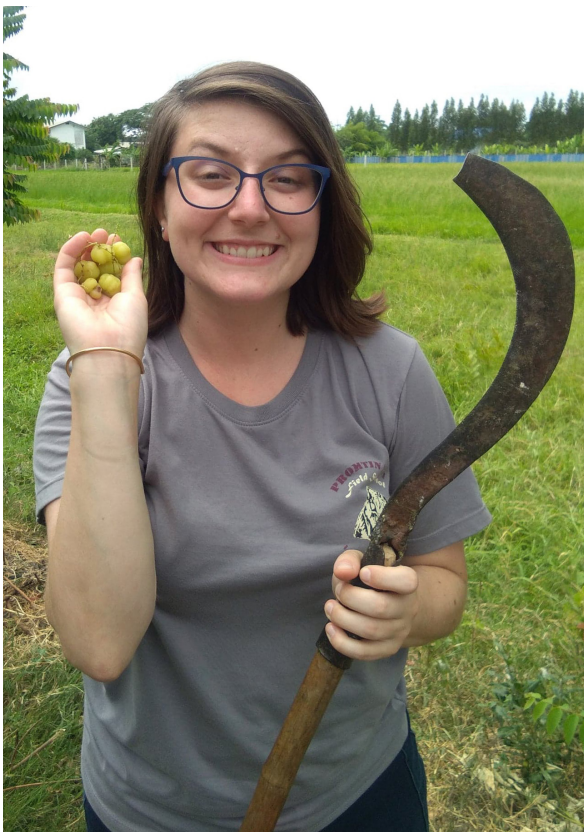
Figure 2: Collecting wild star gooseberries ( Phyllanthus acidus ).

The results of this analysis were published in the August 2019 volume of the International Journal of Osteoarchaeology (DOI: 10.1002/oa.2766).