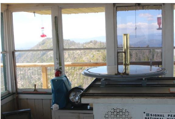
Photo: Inside the Fire Tower.

“I wanted to meet a fellow map jockey. I was also looking for an outside committee member.”