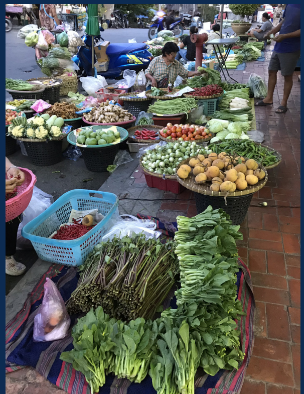
Figure 3: Vendors at the Lopburi Municipal Market selling vegetables, including many wild foraged plants.