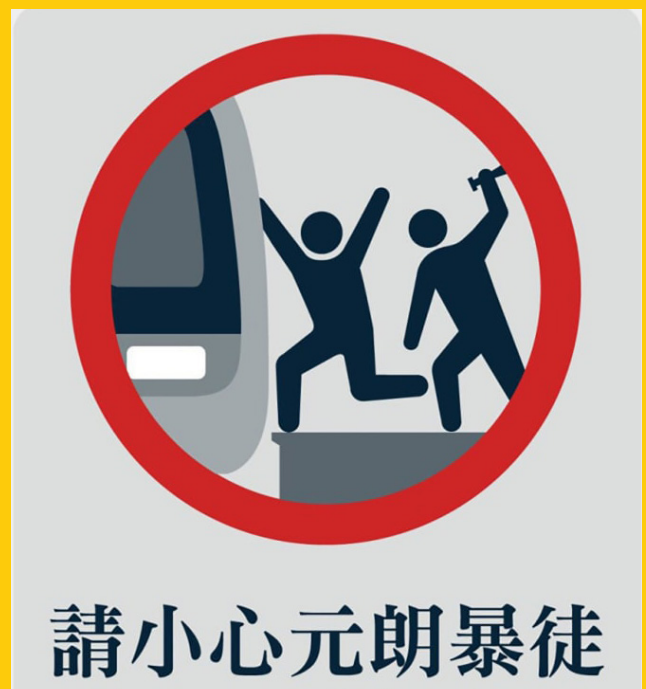
Photo: Anonymous. "Please mind the thug." Poster. © Image courtesy of anonymous artist via Telegram.

The authors of these posters are anonymous. This anonymity shows some hints about the authority tries to create white terror toward the protesters through overreaching surveillance cameras and digital systems intimidating people to speak out of their minds. But the longing for freedom and self-expression is unstoppable. The paranoid reaction toward the pro-democratic protest, in fact, reflects the authority's fear that the contagion of free speech would eventually trigger the collapse of a totalitarian state. To credit the authors of these posters is no longer the most important issue, because these artists are all becoming water, merging together and flowing toward a better future. The art itself speaks a human language for freedom.