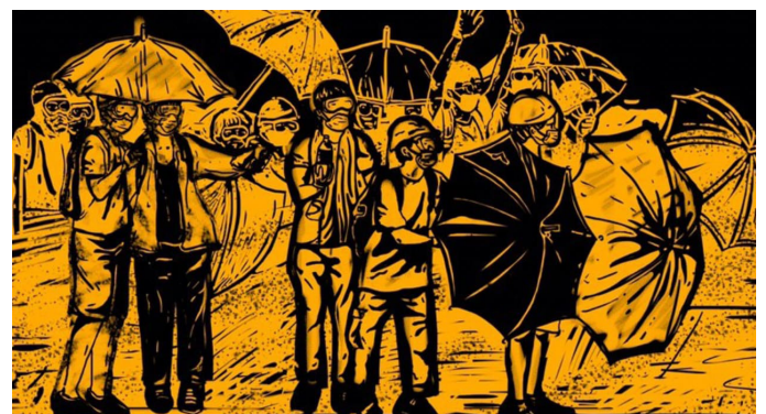
Photo: Anonymous. “Be Water.” Poster. © Image courtesy of anonymous artist via Telegram.

Art, hosting exhibitions, live performances, and book readings. But in April, the Green Wave Art was forced to shut down by the Hong Kong Arts Development Council claiming that the space failed to pass a license for public “entertainment.” The community members, however, believe it is a political censorship particularly an upcoming exhibition in memorizing the 1989 Tiananmen Square protest, planned for months with supports from Hong Kong citizens, was expected to open on June 4th.