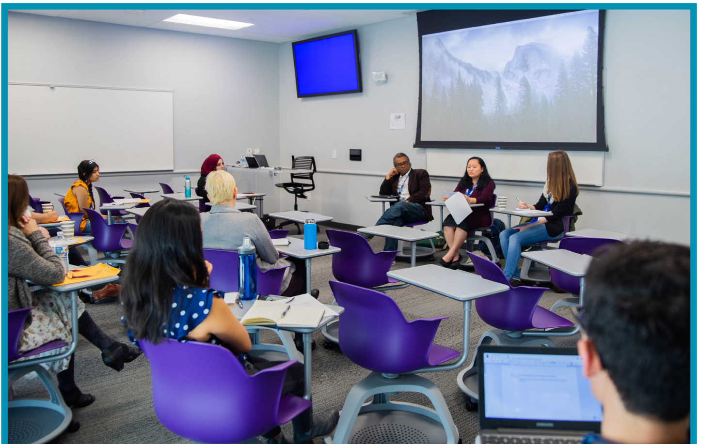
Photo: “The Proverbial University: Race, Surveillance, and Resistance” panel at the 6th Annual Interdisciplinary Humanities Graduate Student Conference at the University of California, Merced.

The 2020 IH Grad Conference will be held April 3-4, 2020 at UC Merced. Please see the attached Call for Papers for submission requirements and additional information. Help us make this conference a success by submitting an abstract and presenting your research. We are looking forward to a wonderful conference. Questions may be sent to ihgradconference@ucmerced.edu .